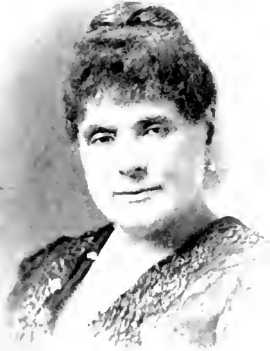
LOUISE CHANDLER MOULTON.